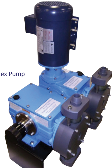
Double Simplex Pump

With UGSI Chemical Feed products, you do not have to compromise on a marginal liquid feed and controls technology for a particular application. Instead, you can choose from multiple technologies to match the best pump to your application.